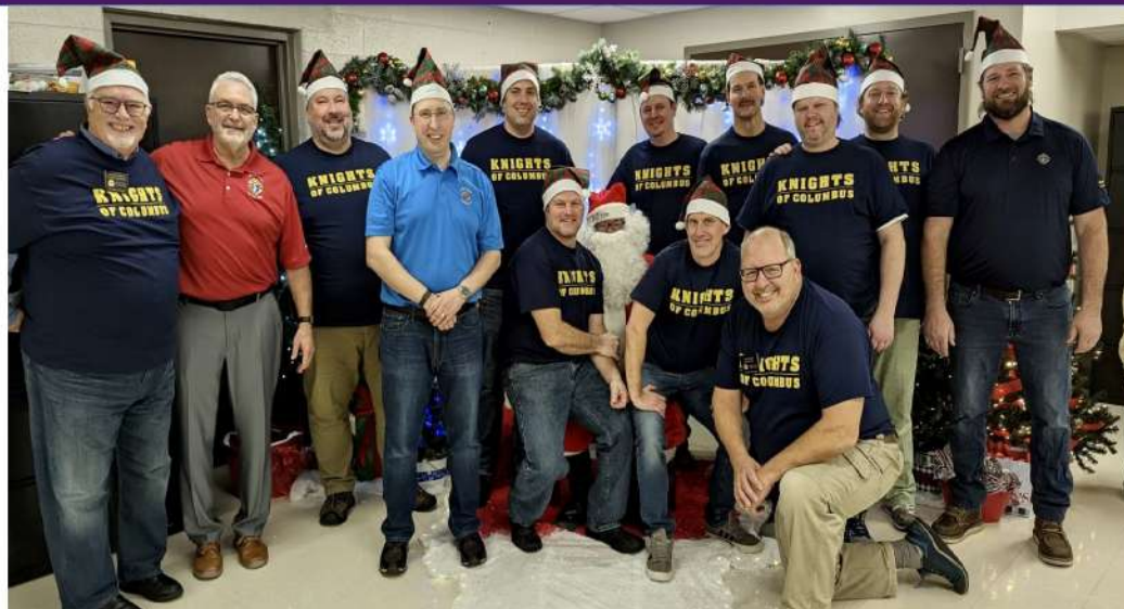
SJV Breakfast with Santa Claus on December 19th THE BREAKFAST CREW