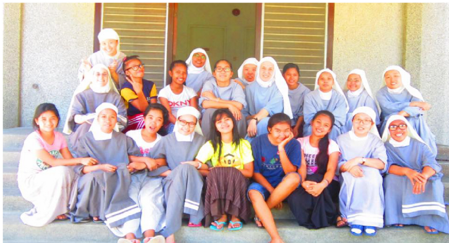
Sisters of Morning Star - Calamba, Philippines

To all the Knights of Columbus 4362, I would like to personally thank you for the tremendously generous donation you made in order to help us to build a hermitage in our garden in order to welcome our chaplains. As contemplative sisters, the daily mass is at the center of our life and so it is so important to have a place to welcome the visiting priests. This week we are finishing up the last details with the contractors, making a few changes and hopefully we will start the construction in the next few weeks. I would definitely keep you posted and send pictures. Thank you very much and GOD Bless each one of you for the service you are offering for the Church.