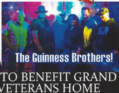
The Guinness Brothers!

PROCEEDS TO BENEFIT GRAND RAPIDS VETERANS HOME