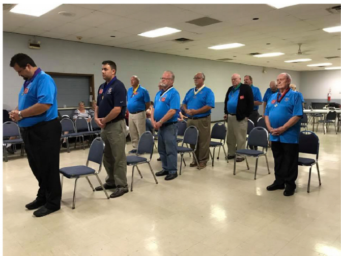
Installation of Officers October 4, 2017